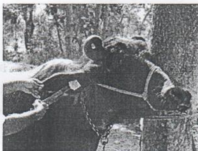
Figure. 3: Ear Tagged animal

The ear tag shall be applied inside the ear of animals, in the center of the ear lobe with the female part of the tag inside the ear.